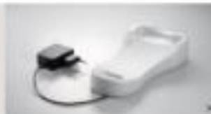
= AS-8520 charging cradle