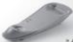
= AS-8020CL charging cradle